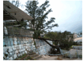
Another tree bites the dust...