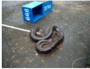
The Burmese Python we caught...