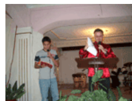
Preaching in Mexico