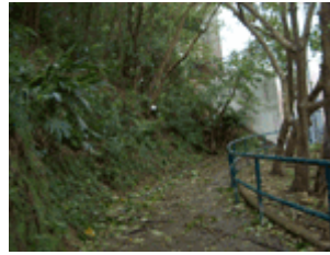
Branches everywhere after the typhoon goes by...