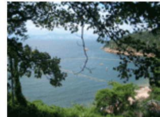
A view from one of the hills looking over the beach towards Hong Kong Island...