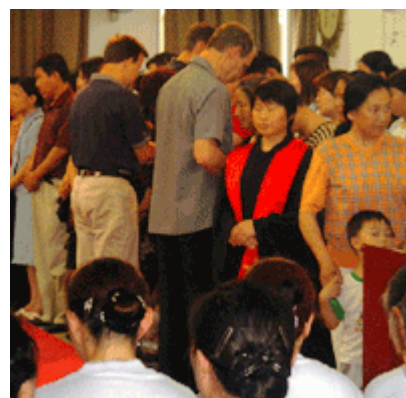
Praying for people in a Three Self Church