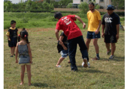
Playing with the kids