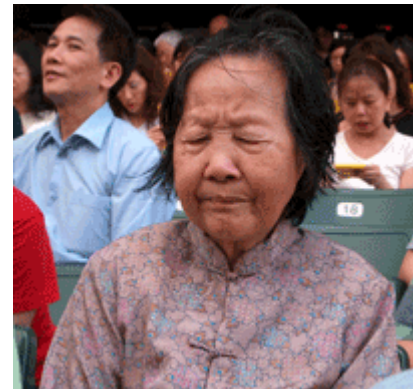
Christians of all ages praying