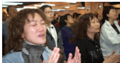
Hong Kong Chinese Christians praying for revival