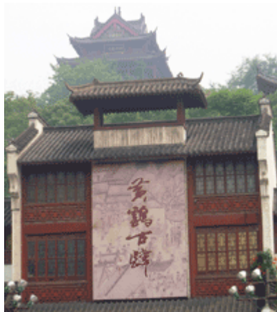
The Yellow Crane Tower