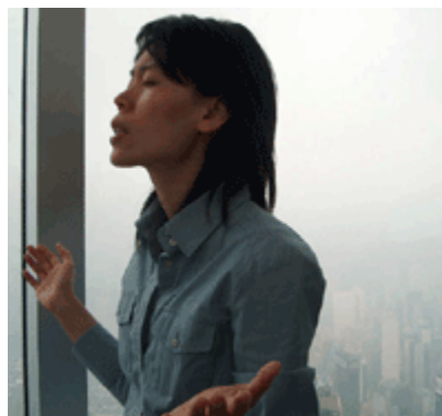
Worshipping the Lord in

God is moving among the marketplace Christians here in Hong Kong. We have been invited to be a part of a group of Christian business professionals who pray for Hong Kong once a month. We meet on the 75th floor ("The Apex") of Central Plaza on Hong Kong Island. From there we can see the whole business district of Hong Kong. What an awesome feeling as you look out over the whole of what you are praying for. We, along with many others believe that Hong Kong is the Gateway to the rest of China. The churches in Hong Kong are coming together, not because of denomination, but what the Lord is saying and doing. Revival is coming!