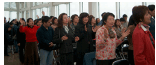
Marketplace Christians worshipping Jesus