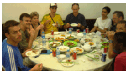
Team lunch Chinese style