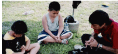
Two boys praying to receive Jesus

On May 21st we had our second village outreach. We invited some professional soccer players to come to the village and play with the children. They taught them soccer drills, and skills to help them play better. One player shared his testimony with the children and three young boys gave their hearts to the Lord.