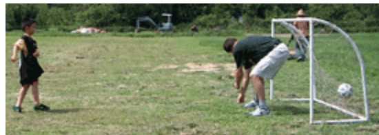
Stephen let's one go by. GOAL!!!