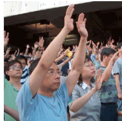
Hands outstretched praying for Mainland China