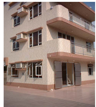
Our new home. We're in the ground floor apartment...