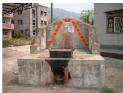
An altar to the earth god...

They also have other beliefs which are a mixture of Chinese traditional religion, Buddhism and Daoism (Taoism). Many homes have idols to the Earth god or other gods.